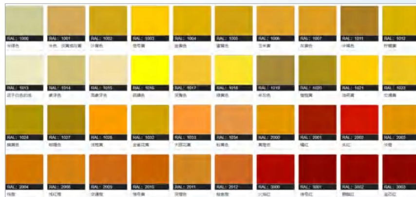
Ral Raul Color Card